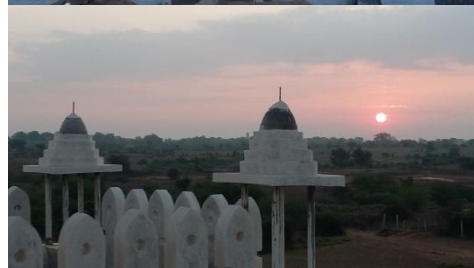
Glimpses of Bharat Uday Gurukul

“This journey of rural transformation has been full of challenges and excitement. The journey involves walking in dust and mud, in the most hostile harsh conditions in the region of Bundelkhand, (U.P.) India.”