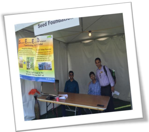
SEED Booth at Ganesh Utsav 2016 in Milpitas